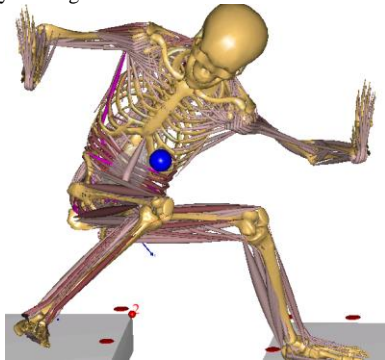
Fig. 1: The musculoskeletal ingress model in the middle of the movement.

We shall undertake this investigation using an individualized model of a particular activity of daily living that is important to many patients and may influence the design of the most common environments for human activity: the ingress movement into an automobile.